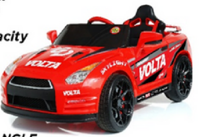
Unique Tire ANGLE