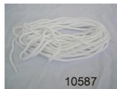
10587 #10587 Restraining Rope PLU# 32944