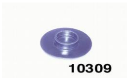
10309 #10309 Leg Cap PLU# 29199