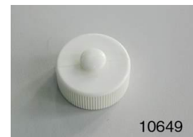
10649 #10649 Drain Valve Cap PLU# 29205