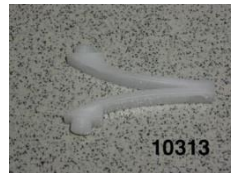
10313 #10313 Spring Pin PLU# 29196