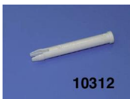
10312 #10312 Long Pin PLU# 29195