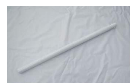
10864 #10864 Vertical Leg (15 x 48) PLU# 29193