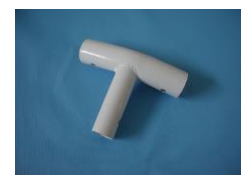
10861 #10861 Leg & Beam Joint (15 x 48) PLU# 30037