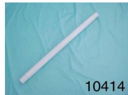
10414 #10414 Horizontal Beam PLU# 29189