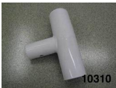
10310 #10310 Leg & Beam T Joint (15 x 36) PLU# 29187