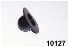
10127 #10127 Strainer Hole Plug PLU# 29200