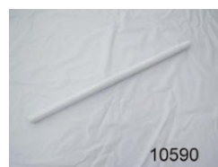
10590 #10590 Vertical Leg (15 x 36) PLU# 29191